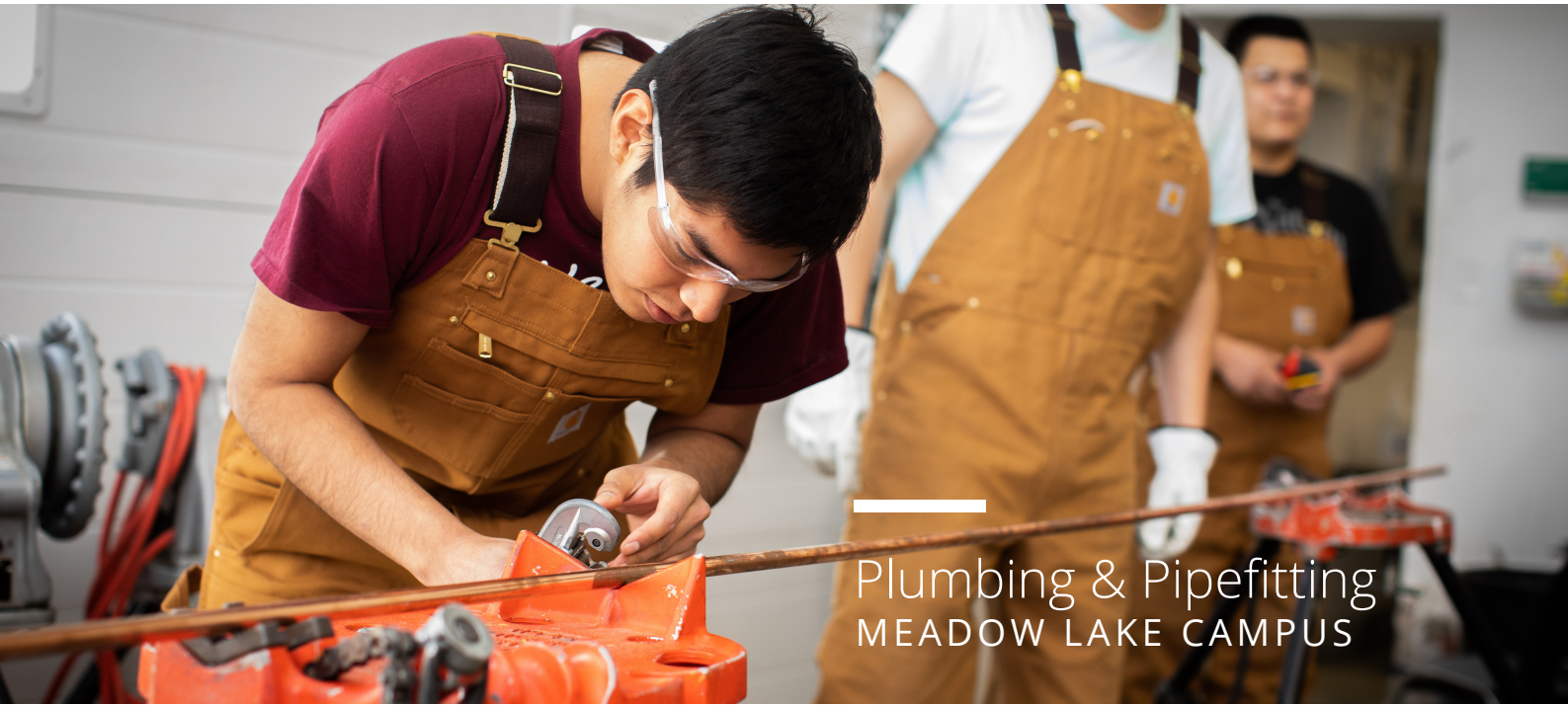
Plumbing & Pipefitting MEADOW LAKE CAMPUS

To provide lifelong learning opportunities as a means of enhancing the economic, cultural, and social wellbeing of the individuals and communities we serve.